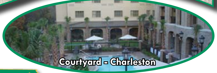
Courtyard - Charleston