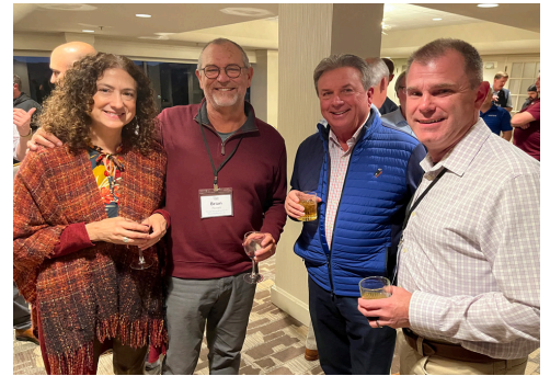
Fall Conference - Asheville, NC