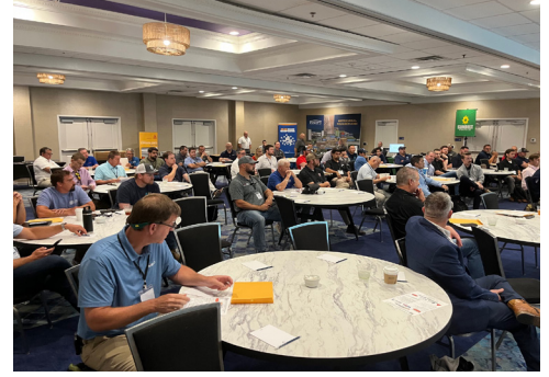
Spring Conference - Charleston, SC