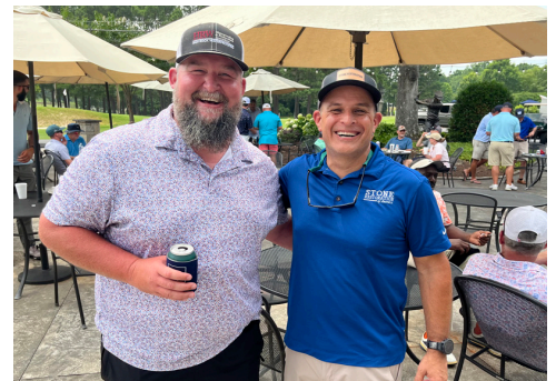
Joint Golf Tournament with the WCA - Forest Oaks in Greenboro, NC